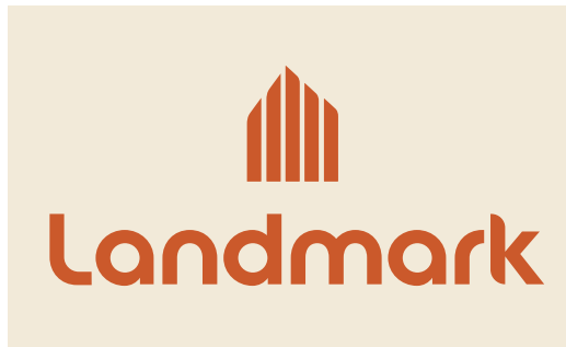
STACKED LOGO REVERSED - ORANGE

Mono version in black – to be used on white or pale backgrounds when colour is not available