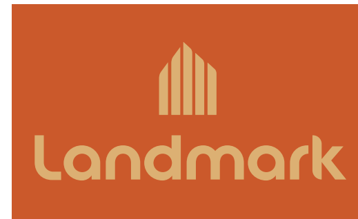
STACKED LOGO REVERSED- BRONZE FLAT COLOUR

Bronze highlight reversed to be used where appropriate in print or digital formats