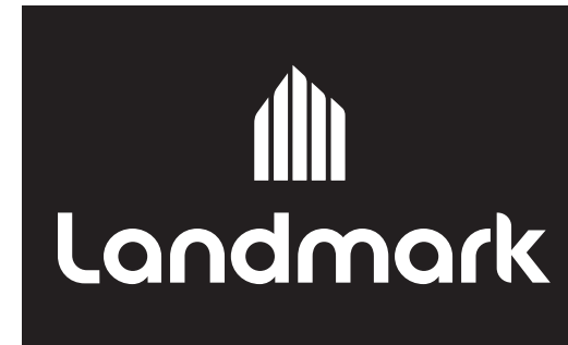
STACKED LOGO- MONOTONE REVERSED

Reversed orange flat colour to be used wherever possible on an bone or solid colour background