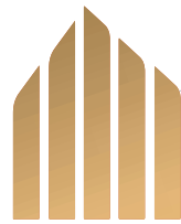
GOLD FOIL: KURZ LUXOR 420

Gold foil to be used on print materials wherever possible to enhance brand aesthetic. Materials such as business cards, brochures, direct mail and letterheads can utilise a gold foiled logo or brand icon as a premium finish. A printed version can be used in circumstances where foil is not possible