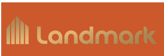
STACKED LOGO REVERSED - BRONZE HIGHLIGHT

Full colour logo bronze or orange to be used wherever possible, when on a white or pale background