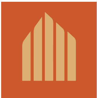
BRONZE FLAT COLOUR