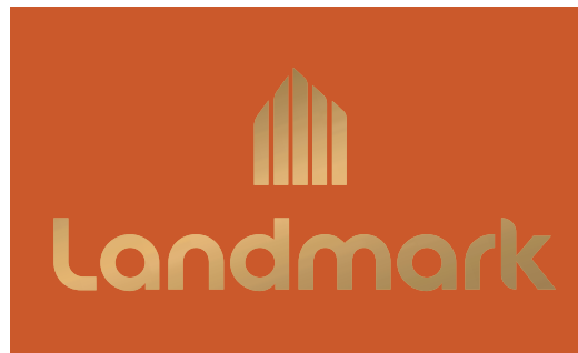
STACKED LOGO REVERSED - BRONZE HIGHLIGHT

Full colour logo bronze or orange to be used wherever possible, when on a white or pale background