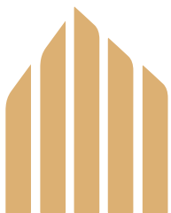
BRONZE FLAT COLOUR