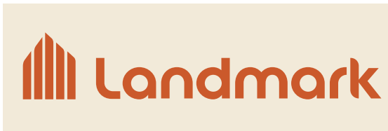
STACKED LOGO REVERSED- ORANGE FLAT COLOUR

Mono version in black – to be used on white or pale backgrounds when colour is not available.