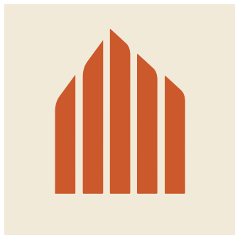
ORANGE FLAT COLOUR